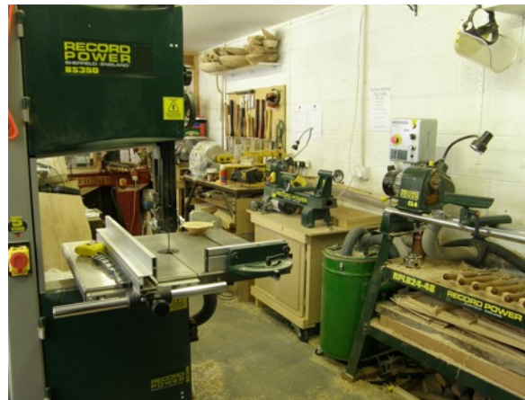
A fully equipped workshop with advice on buying equipment and how to look after your equipment.

1 Day course: - aimed for you to try woodturning, this course will cover the basics and you will take home your item you have turned on the course.