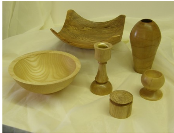
A selection of items that can be made on the course.

Course run one to one, unless you want to bring a friend. In a fully equipped workshop with dust control and fully insured.